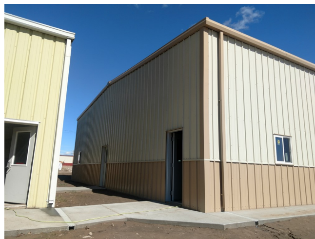
The new building (pictured to the right, in above photo) is built within steps to the old shop. The older shop is, and will continue to be, used for equipment and materials storage.

Expansion of NEA's facilities in Harrison is underway. Having outgrown the original shop long ago and needing new space for current equipment and supplies, another building (with the height for housing today's bucket trucks) is in the hands of Coon Construction and due to be finished before year's end.